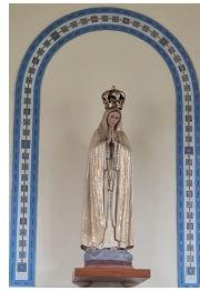
Our Lady statue in our Lady Chapel

Next week's 2nd Collection is for CaTEW - Catholic Trust for England & Wales