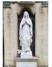
Our Lady statue in our Marian Garden

Hail, holy Queen, Mother of Mercy! Our life, our sweetness, and our hope! To thee do we cry, poor banished children of Eve; to thee do we send up our sighs, mourning and weeping in this valley of tears. Turn, then, most gracious Advocate, thine eyes of mercy toward us; and after this our exile show unto us the blessed fruit of thy womb, Jesus. O clement, O loving, O sweet Virgin Mary.