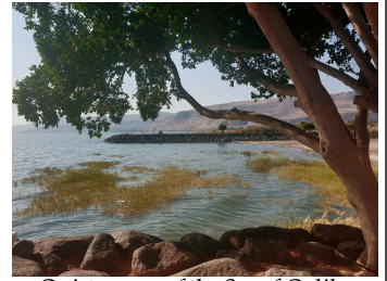
Quiet corner of the Sea of Galilee

IN TODAY'S GOSPEL FROM MARK , we see the extent of Jesus's compassion. He had been teaching and preaching, whilst the Apostles had been doing the same elsewhere. None of them had had time to rest or eat. Jesus attempts to find a more deserted part on the shores of the Sea of Galilee, but they were followed. Despite being exhausted, Jesus took pity on the people, and continue to teach them. Jesus also demonstrates to us the importance of rest and quiet, which we can find in our life of prayer and in our celebration of the Eucharist.