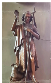
Statue at St Joseph's Church

The Church usually observes the day of a saint's death as his feast, because that day marks his entrance into heaven. There are two notable exceptions, the birthdays of Blessed Mary and of St John the Baptist - all other humans were stained with original sin at birth. But Mary, already in the first moment of her existence, was free from original sin (for which reason even her very conception is commemorated by a special feast), and John was cleansed of original sin in the womb of his mother. This is the dogmatic justification for today's feast. John was the one chosen to announce the coming of Our Lord, preparing the world for Him, therefore his date of birth is sacred. Grant, we pray, almighty God, that your family may walk in the way of salvation and, attentive to what Saint John the Precursor urged, may come safely to the One he foretold, our Lord Jesus Christ, Who lives and reigns with you in the unity of the Holy Spirit, God, for ever and ever.