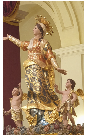
'The Assumption', Dingli, Malta

The Feast of the Assumption of Mary is a very important day in our Catholic faith. Also known as the 'Dormition of the Virgin Mary', it is the principal feast of the Blessed Virgin, the Mother of Jesus Christ. This feast commemorates two events - the departure of Mary from this life and the assumption of her body into heaven. The Church's official doctrine of the Assumption says that at the end of her life on earth Mary was assumed, body and soul, into heaven. Some mistakenly say Mary "ascended" into heaven, which is incorrect according to the Bible. It was Jesus Christ who ascended into heaven, by his own power. But Mary was assumed or taken up into heaven by God. Observed as a holy day of obligation by Catholics and as a public holiday in some countries, the Feast of the Assumption is considered as Holy Mary's "heavenly birthday" and this is not a day of mourning for her loss, but a celebration of joy for the union of the mother with her beloved son. As this is a religious holiday, the Assumption is most commonly celebrated by attending Mass - in many Catholic countries, there are also outdoor festivities including bands and fireworks. Here in St Joseph's we will have the usual 10am Mass and an additional Mass at 7pm.