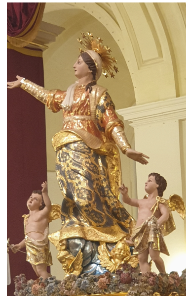
'The Assumption', Dingli, Malta

Here in St Joseph's we will have the usual 10am Mass and an additional Mass at 7pm - this means that, as on other Holy Day of Obligation, Adoration will finish at 6pm.