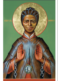
St. Josephine Bakhita

O God, who led Saint Josephine Bakhita from abject slavery to the dignity of being your daughter and a bride of Christ, Grant, we pray, that by her example, we may show constant love for the Lord Jesus crucified, remaining steadfast in charity and prompt to show compassion. Through Christ our Lord.